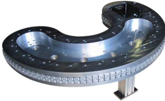
Custom Conveyor with Unique Geometry and 37.5 Pitch

MID Precision link conveyors were designed to be used in high volume manufacturing environments to provide millions of cycles without any maintenance or issues. The only maintenance on the conveyor is to adjust the tension of the chain annually and if the conveyor is used in a dirty environment, clean the conveyor as required.