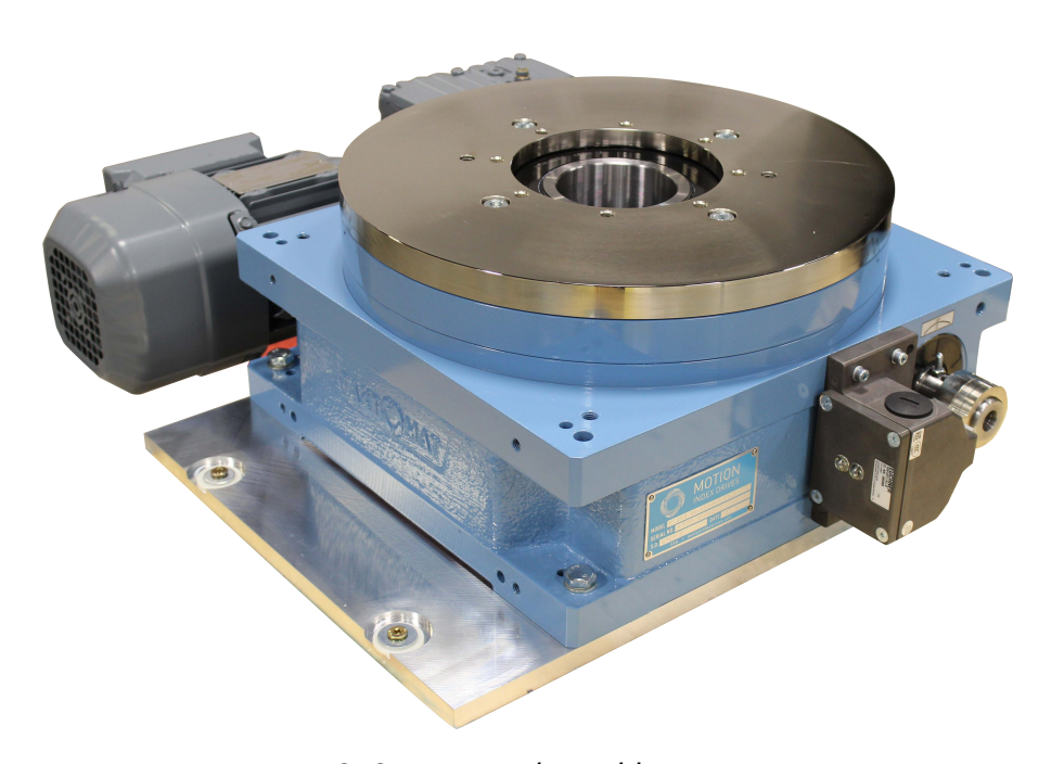
RT250 Rotary Index Table